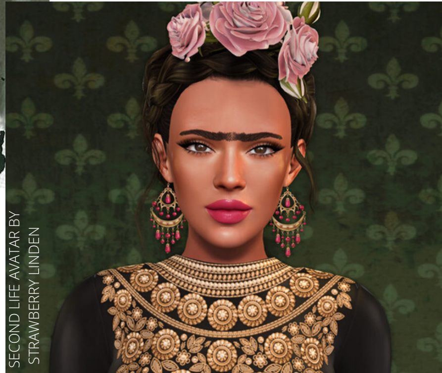
SECOND LIFE AVATAR BY STRAWBERRY LINDEN