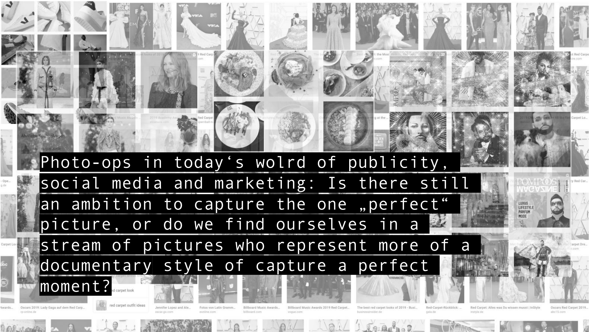
Photo-ops in today's world of publicity, social media and marketing: Is there still an ambition to capture the one „perfect“ picture, or do we find ourselves in a stream of pictures who represent more of a documentary style of capture a perfect moment?