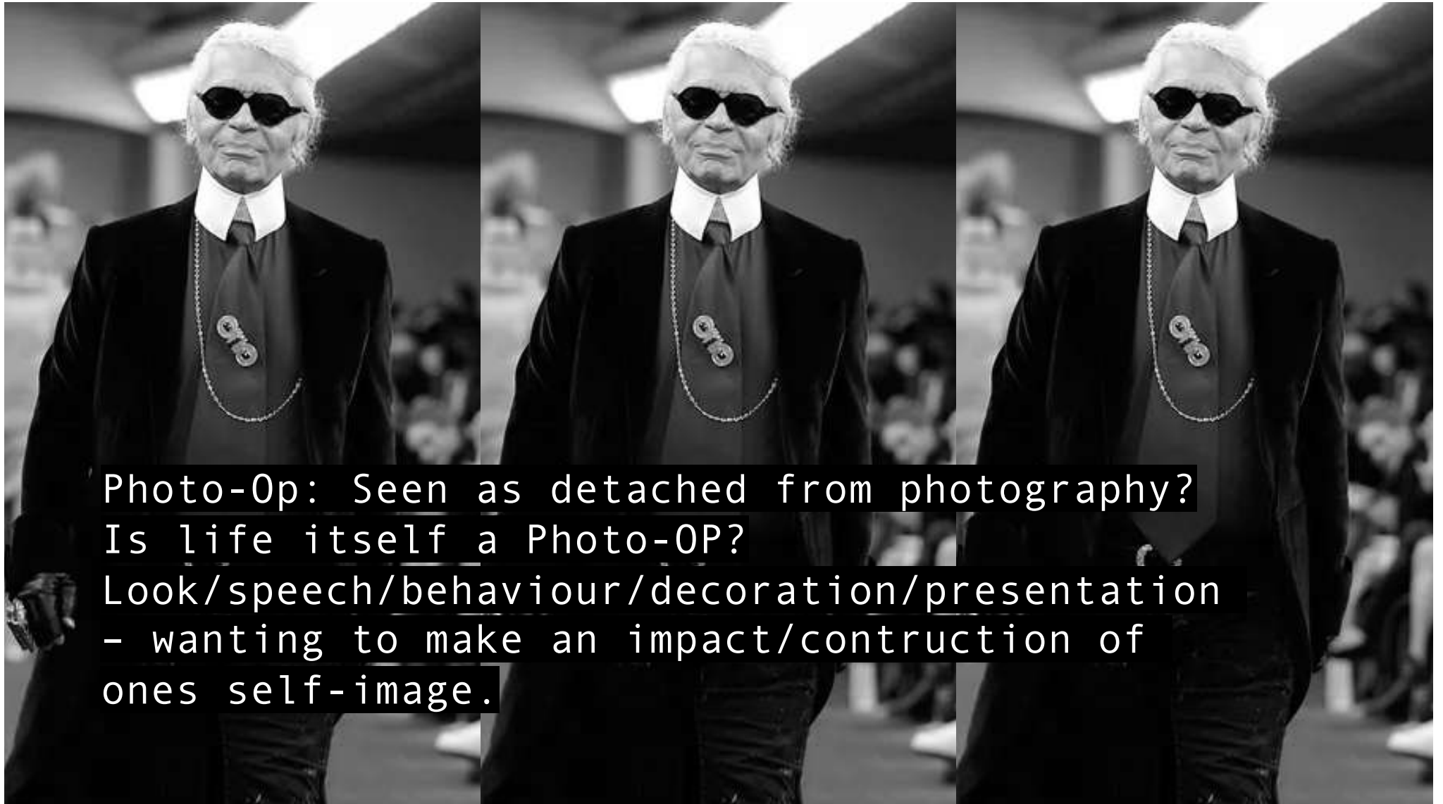
Photo-Op: Seen as detached from photography? Is life itself a Photo-OP? Look/speech/behaviour/decoration/presentation - wanting to make an impact/contruction of ones self-image.